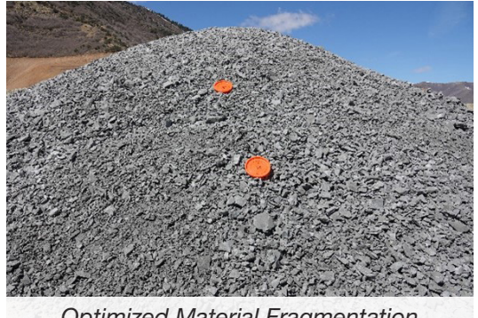
Optimized Material Fragmentation