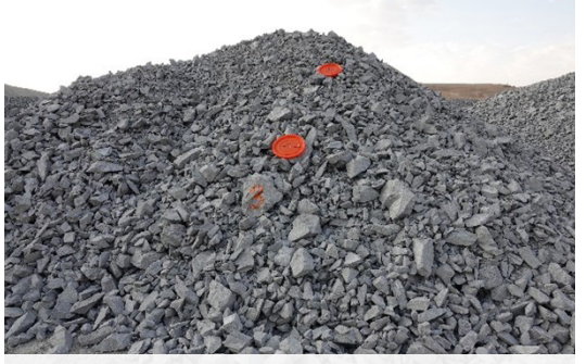
Baseline Material Fragmentation